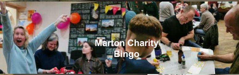
Marton Charity Bingo