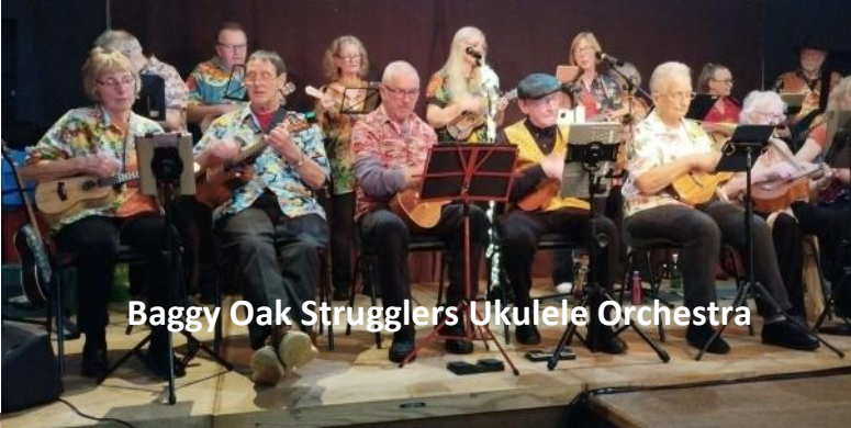
Baggy Oak Strugglers Ukulele Orchestra