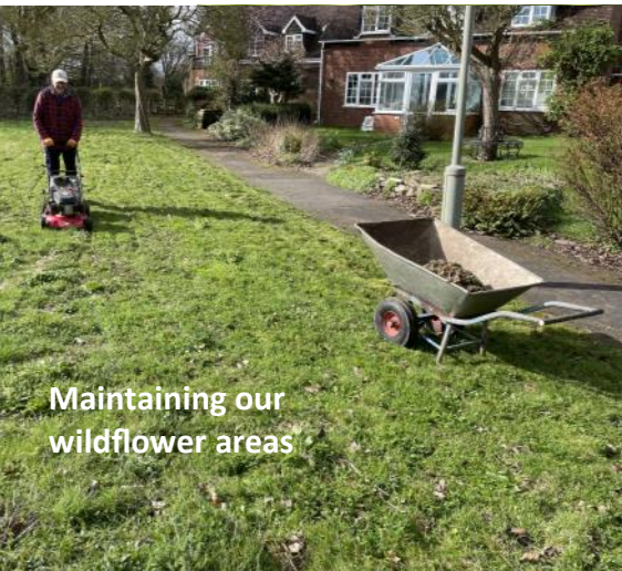
Maintaining our wildflower areas