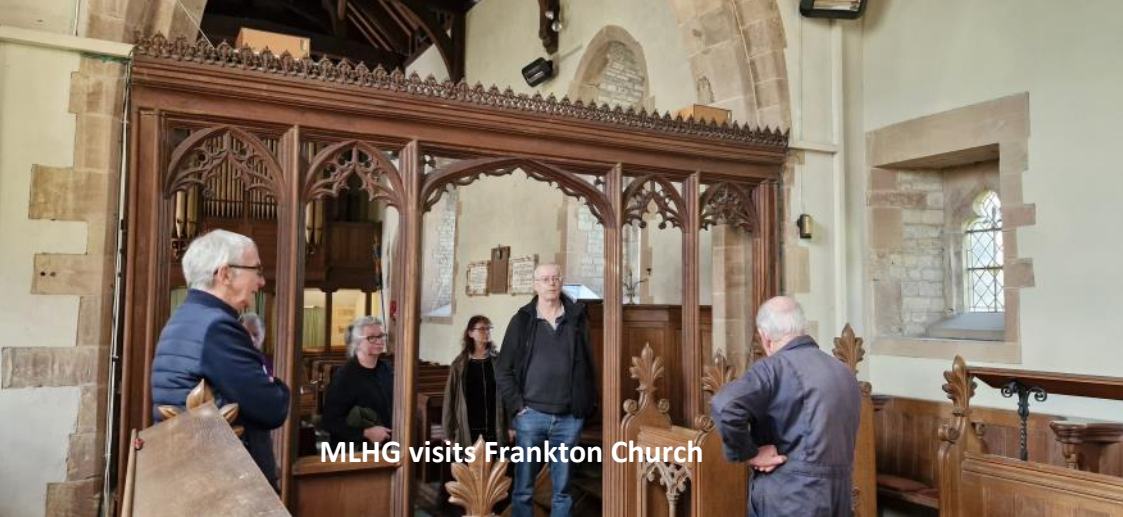
MLHG visits Frankton Church