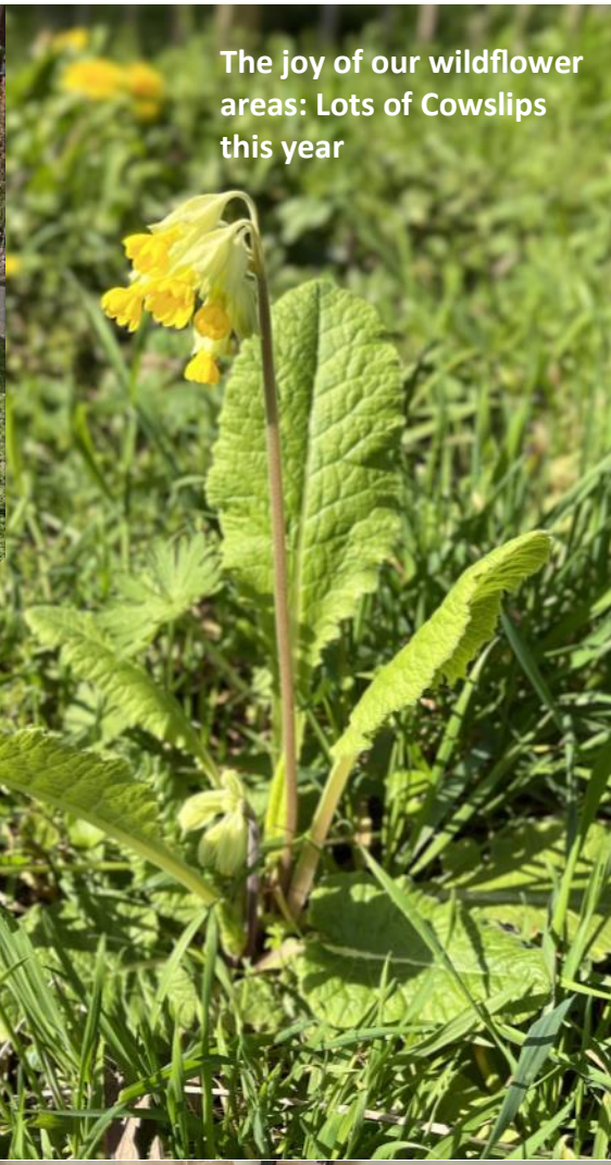
The joy of our wildflower areas: Lots of Cowslips this year